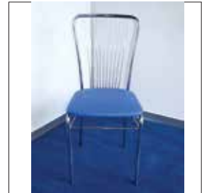
Scaun albastru EUR 10.00 Cod 08 (stoc 6 buc.)