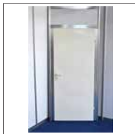
Usa in structura EUR 29.00 Cod 25