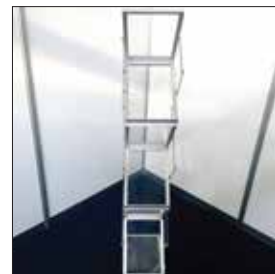
Suport plante EUR 50.00 Cod 23