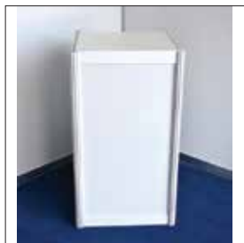
Paralelipiped etalare EUR 15.00 Cod 20 (50x50x100 cm)