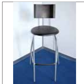
Scaun bar negru EUR 10.00 Cod 10