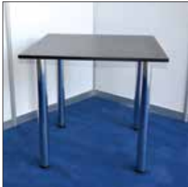
Masa neagra standard EUR 15.00 Cod 01 (80x80x72 cm)