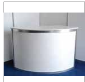
Info desk semicircular EUR 35.00 Cod 12