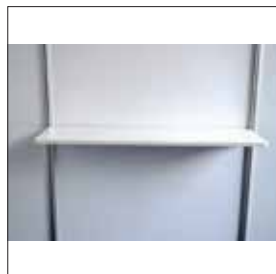
Polita in structura EUR 5.00 Cod 21 (100x30 cm)