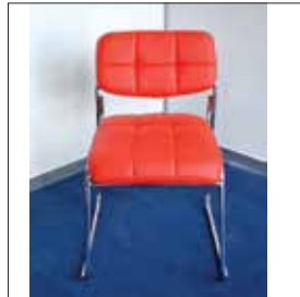
Scaun rosu EUR 10.00 Cod 06 (stoc 8 buc.)