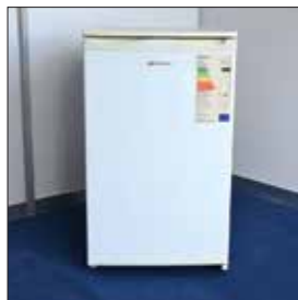
Frigider EUR 35.00 Cod 22 (60x60x100 cm)