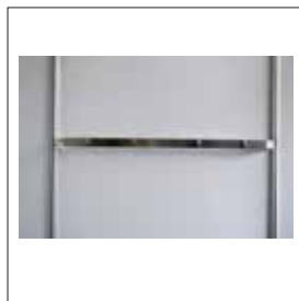
Cuier in structura EUR 4.00 Cod 26