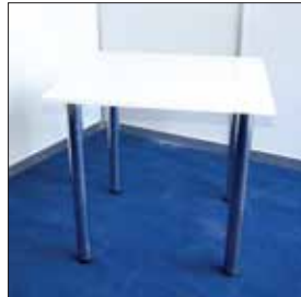
Masa alba EUR 15.00 Cod 02 (80x80x72 cm)