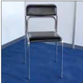
Scaun negru standard EUR 7.00 Cod 05