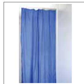
Draperie EUR 10.00 Cod 27 (100x250 cm)