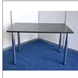
Masa dreptunghiulara EUR 15.00 Cod 03 (120x80x72 cm)