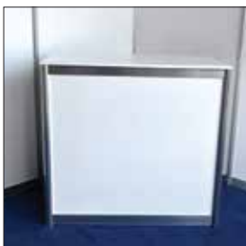
Info desk 1 EUR 30.00 Cod 13 (100x50x96 cm)