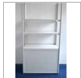
Polite in structura EUR 35.00 Cod 19 (100x50x200 cm)