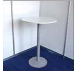
Masa bar EUR 20.00 Cod 04 (diametru 60 cm)