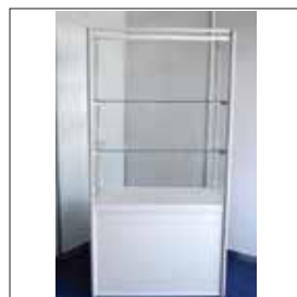
Vitrina 1 EUR 65.00 Cod 17 (100x50x200 cm)