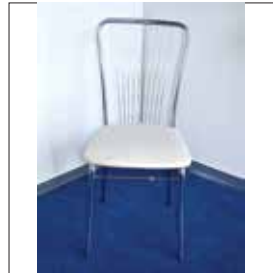
Scaun alb EUR 10.00 Cod 07 (stoc 9 buc.)