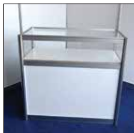
Desk vitrat 1 EUR 30.00 Cod 15 (100x50x96 cm)