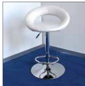
Scaun bar alb EUR 10.00 Cod 11 (stoc 8 buc.)