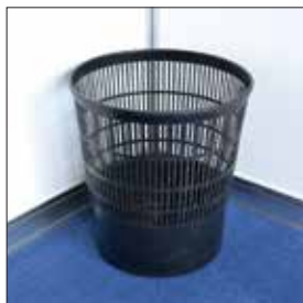
Cos gunoi EUR 2.00 Cod 28