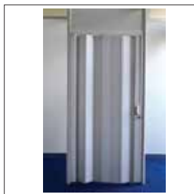
Usa plianta EUR 29.00 Cod 24